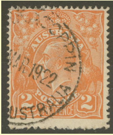
Lost $3000 on this

The “hammer” price is nothing remotely like what you as the seller will eventually receive. Most sellers blissfully disregard this reality.