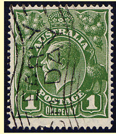
Sold for $1,048

Please look at it carefully before you read any further and decide whether you