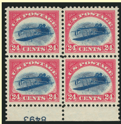
Sold for $4 million

As I reported in my column at the time, the sale of that "Z" Grill stamp caused a sensation. The stamp is illustrated nearby.