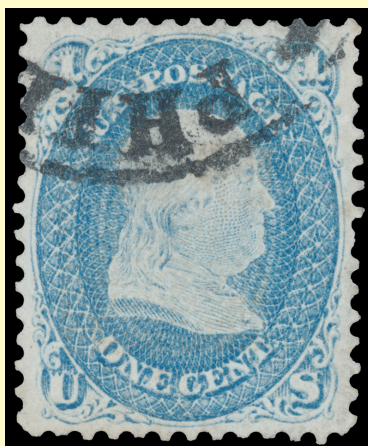
The $4 million stamp

The good news is that BOTH the existing 1¢ "Z" grills will be on display at the